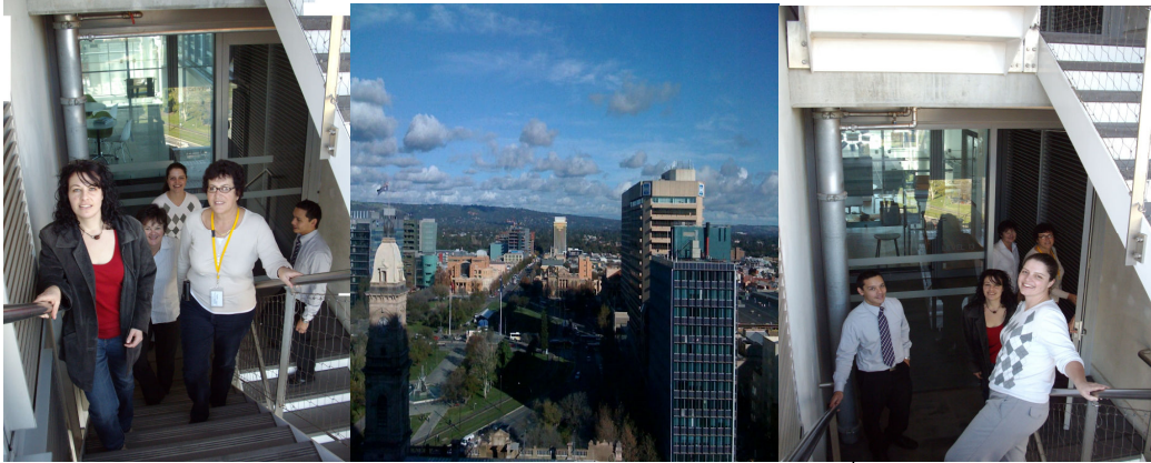
*Staff enjoying the views from the stairwell as they walk up to the 21 st floor of the building!

As part of the Department's Health and Life Strategy staff are also encouraged to count their steps taken on weekends. Some staff have actually gone to parts of the Kidman Trail for a weekend walk. Some other staff have plans to tackle the Kidman Trail by horse!