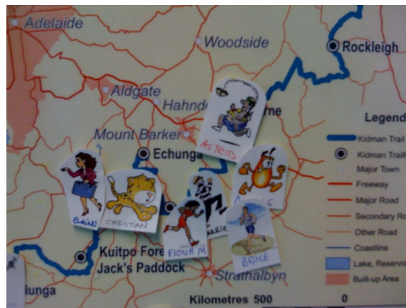
* Walking Challenge Kidman Trail Map including individual markers

The staff have really taken to the challenge and are increasing their daily steps taken by getting off the bus a stop or two earlier, going for walks at lunchtime, and organising walking groups to tackle the buildings stairs on their breaks. As you can see from the photo's, we get some magnificent views of Adelaide and the hills from the stairwell.